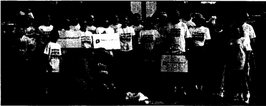
Komen Race PPCT Team

Thanks to The Central Texas Affiliate of The Susan G. Komen Foundation, in 2003, $25,000 was granted to PPCT's mammography program to provide screening to 300 low-income women and an additional $10,000 for abnormal mammography follow-up diagnostic testing.